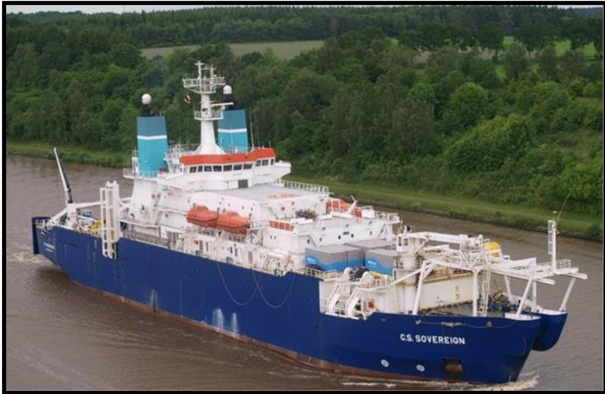
Figure 2 – 'CS Sovereign'

The 'CS Sovereign' will maintain a listening watch on VHF channel 12 and will display the lights and shapes as required by the International Regulations for Preventing Collisions at Sea (COLREGs).